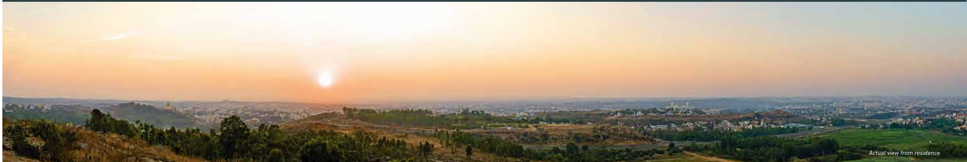
Actual view from residence

MANY RESIDENCES CAN PAMPER YOU WITH LUXURY.