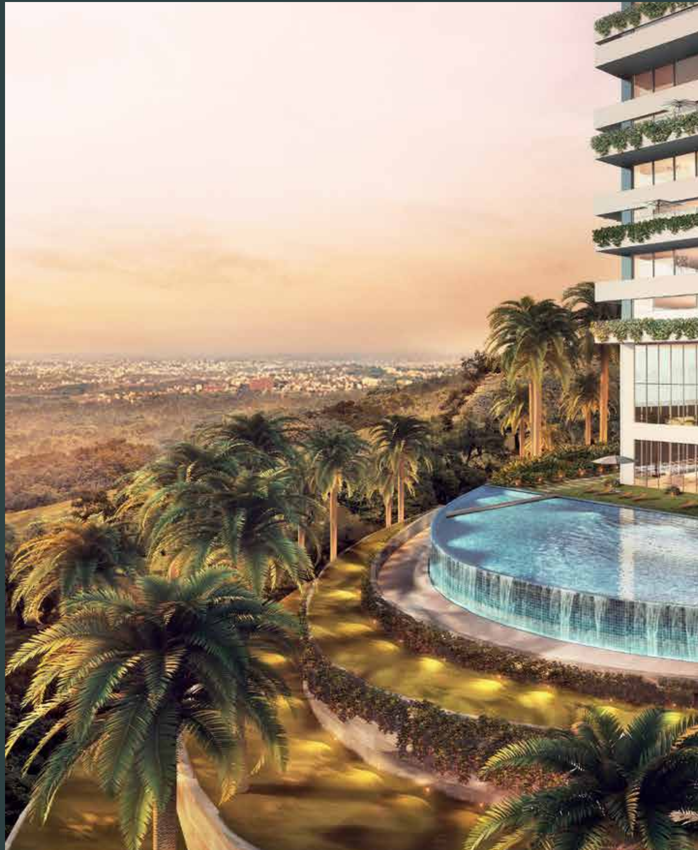
Infinity pool overlooking city