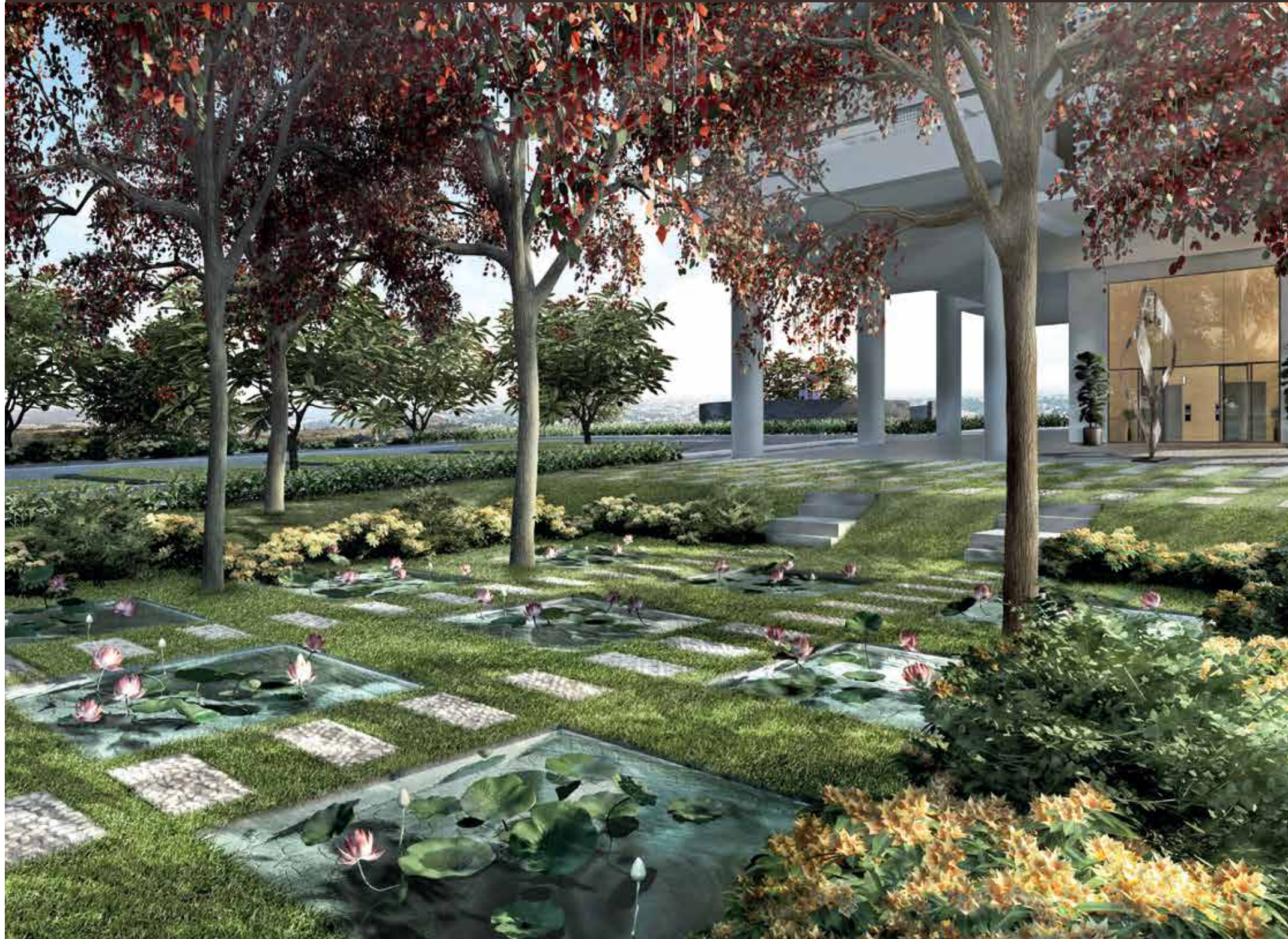
Lush landscapes invite residents to enjoy open views of the city below